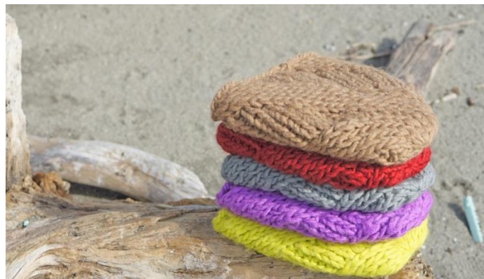
Shown from top to bottom #020 (Chocolate Milk), #046 (Crimson), #037 (Gun Metal Grey), #117 (Dark Orchid), and #113 (Electric Pear).

RM Remove Marker rnd(s) round(s) sl slip as if to purl SSK Slip 2 stitches knit wise, one at a time, from the left needle to the right needle, then insert the left needle into the front of the slipped stitches and knit them together (decreases 1 stitch). x times