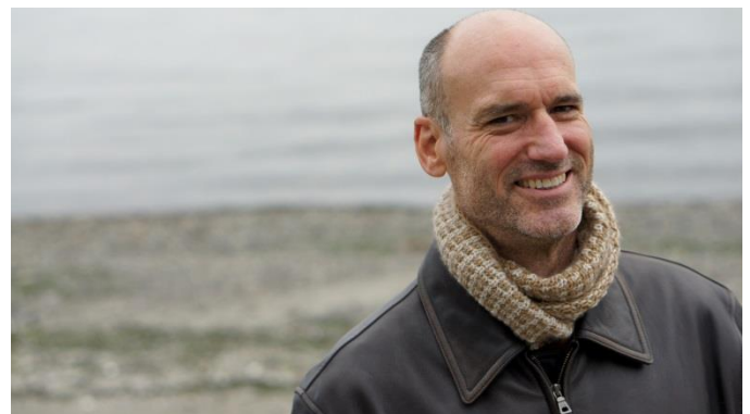
Loop shown in Schoppel Cashmere Queen #7130 & #7181.

skacel collection, Inc. Copyright © 2014 - All rights reserved. www.skacelknitting.com