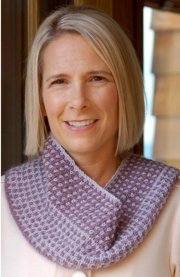
Loop shown in Schoppel Cashmere Queen #3543 & #2965.

FINISHING: Loosely bind off all sts. Weave in ends.