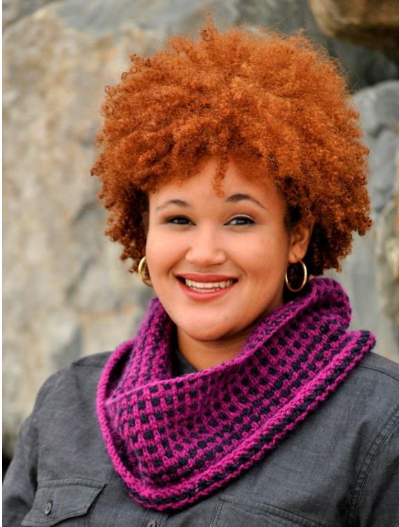
Loop shown in HiKoo Kenzie #1014 & #1015.