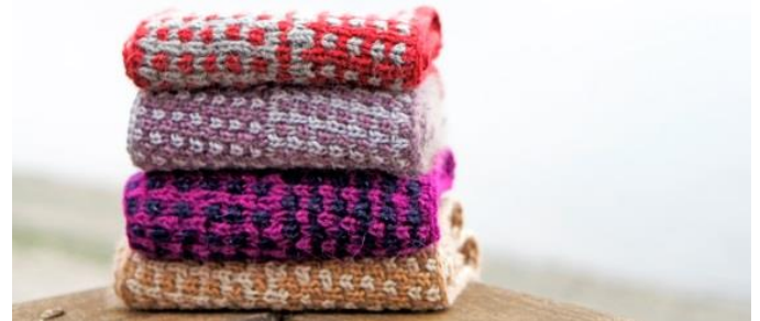
Loops shown (top to bottom) in HiKoo Kenzie #1011 & #1018, Schoppel Cashmere Queen #3543 & #2965, HiKoo Kenzie #1014 & #1015, and Schoppel Cashmere Queen #7130 & #7181.

Rep Rnds 1 - 6 until piece meas 3.25", ending after working Rnd 6.