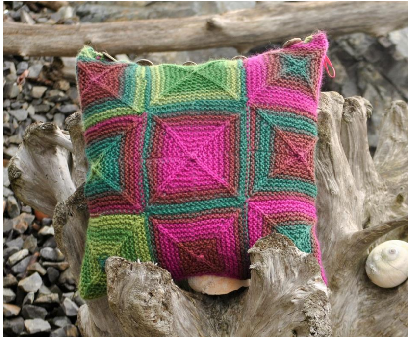
Shown in color #2249

Designed by Marcy New for skacel collection, Inc.