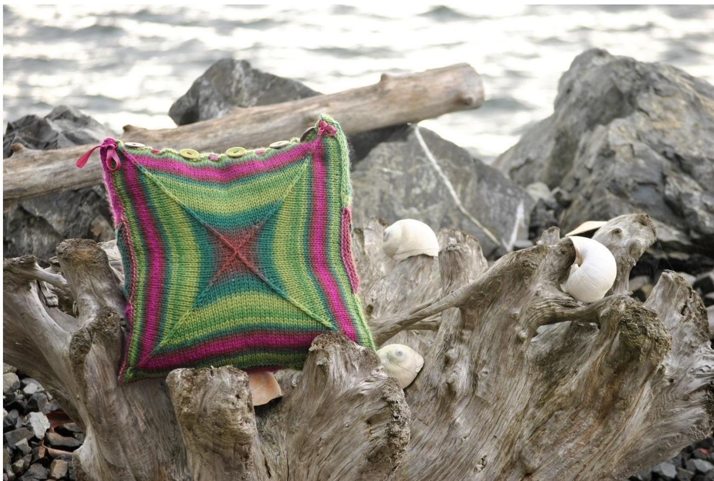
'Back' with Ribbon Finishing