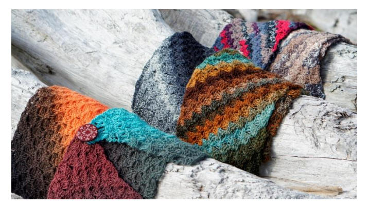
Loops shown above, from left to right: Schoppel Zauberball 100 #2247 & #2245; Schoppel Zauberball Crazy #2100 & #1660; Schoppel Ambiente #2183 & #1864.