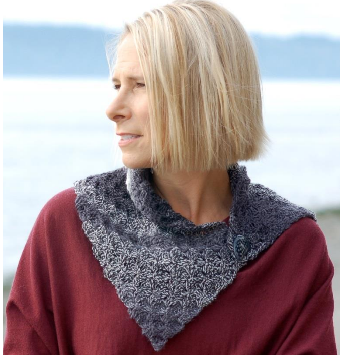
Loop shown in Schoppel Zauberball Crazy #2100.