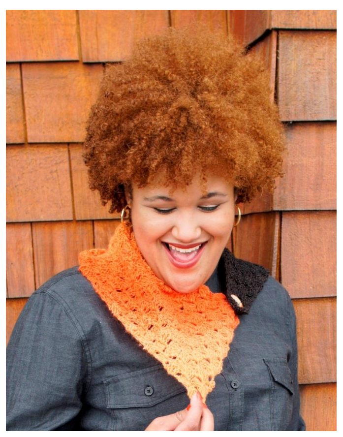
Loop shown in Schoppel Zauberball 100 #2247.

skacel collection, Inc. Copyright<sup>©</sup> 2014 - All rights reserved. www.skacelknitting.com