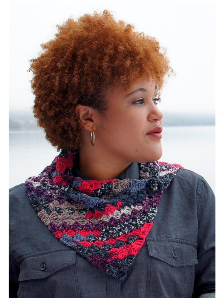
Loop shown in Schoppel Ambiente #2183.