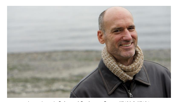
Loop\ shown\ in\ \textbf{Schoppel\ Cashmere\ Queen}\ \#7130\ \&\ \#7181.