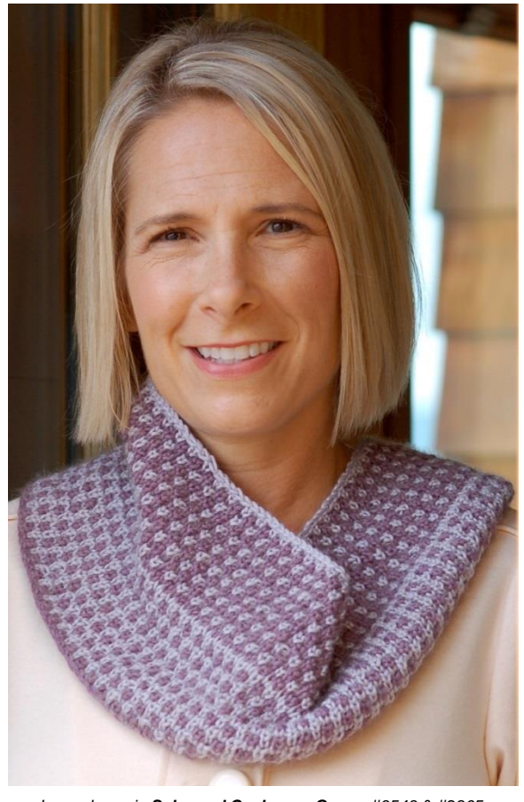
Loop shown in Schoppel Cashmere Queen #3543 & #2965.

FINISHING: Loosely bind off all sts. Weave in ends.