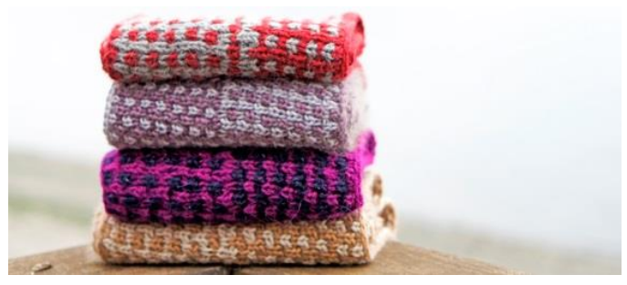
Loops shown (top to bottom) in HiKoo Kenzie #1011 & #1018, Schoppel Cashmere Queen #3543 & #2965, HiKoo Kenzie #1014 & #1015, and Schoppel Cashmere Queen #7130 & #7181.

Rep Rnds 1 - 6 until piece meas 3.25", ending after working Rnd 6.