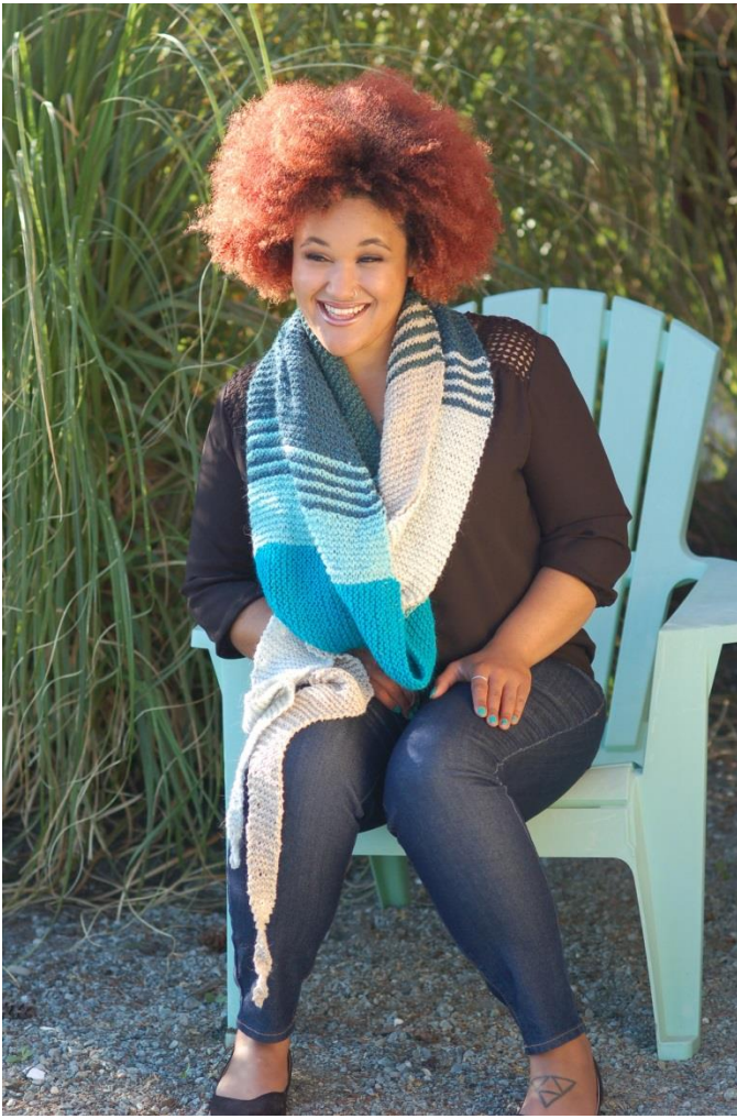
Large shown in Kenzie A (#1024-Hokitika), B (#1022-Ruapehu), C (#1013-Tekapo), D (#1010-Glacier), E (#1008-Kale), and F (#1000-Pavlova).