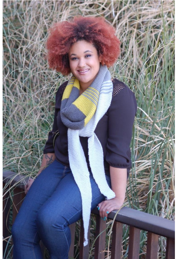
Small size shown in A (#038-Seattle Sky), B (#039-Chartreuse), C & F (#036-Silver Hair), and D & E (#037-Gun Metal Grey).

Thread yarn through remaining stitch and cinch closed.