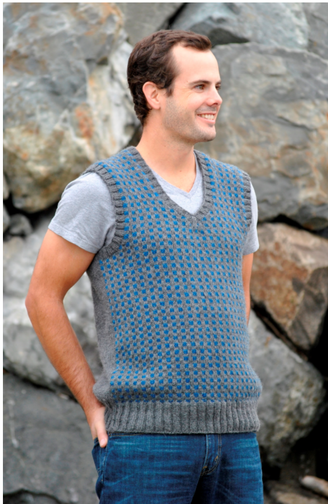
Large, shown in MC & CC2 (#100 - Slate Grey), and CC1 (#098 - Bright Blue)

Designed by John Crane for skacel collection, Inc.