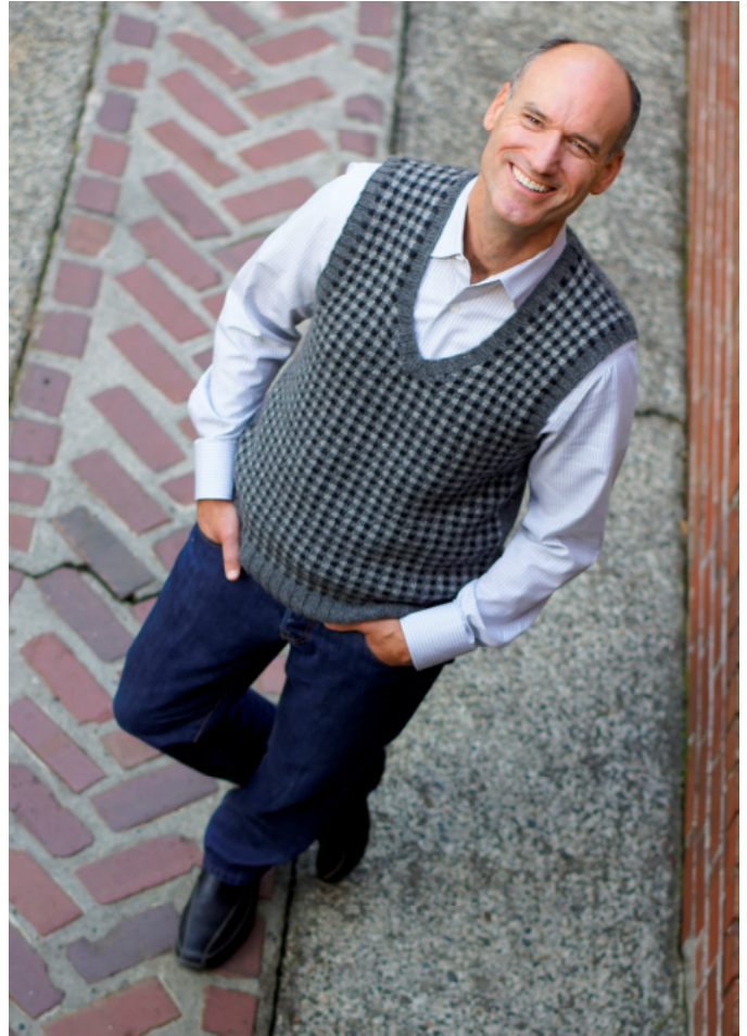
Large, shown in MC (#100 - Slate Grey), CC1 (#002 - Black), and CC2 (#099 - Grey Flannel).