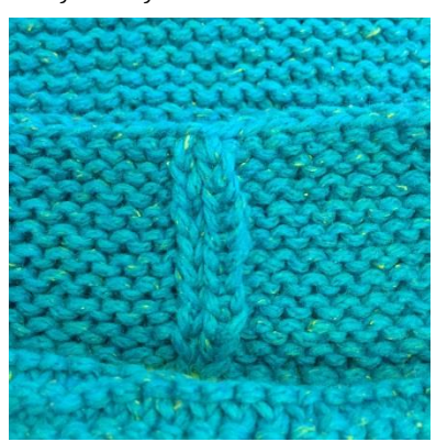
Closeup of seam at back of neck.

Row 21: Knit to 2nd marker, *RM, turn work, SP, k4, PM, knit to next marker; rep from * until only 2 sts rem between markers, then cont knitting all the way to the end of the row, working SP sts as one and removing markers as they are encountered. Row 22: Knit across to the other edge, working SP sts as one and removing markers as they are encountered. Bind off all sts very loosely.