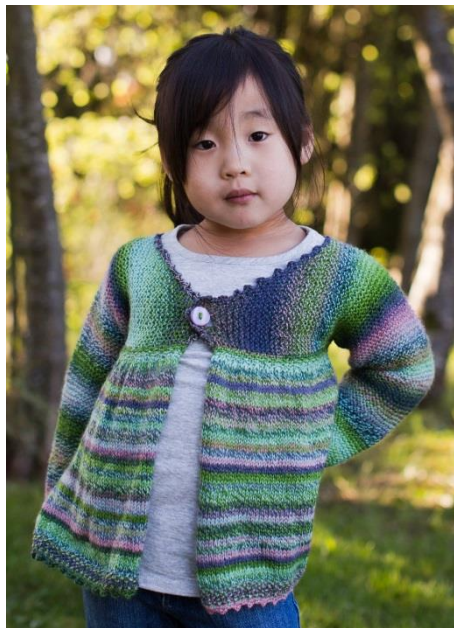
Zauberball Stärke 6 #2170

Designed by The Sassy Skein for skacel collection, Inc.