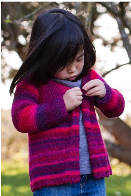
Zauberball Stärke 6 #2095