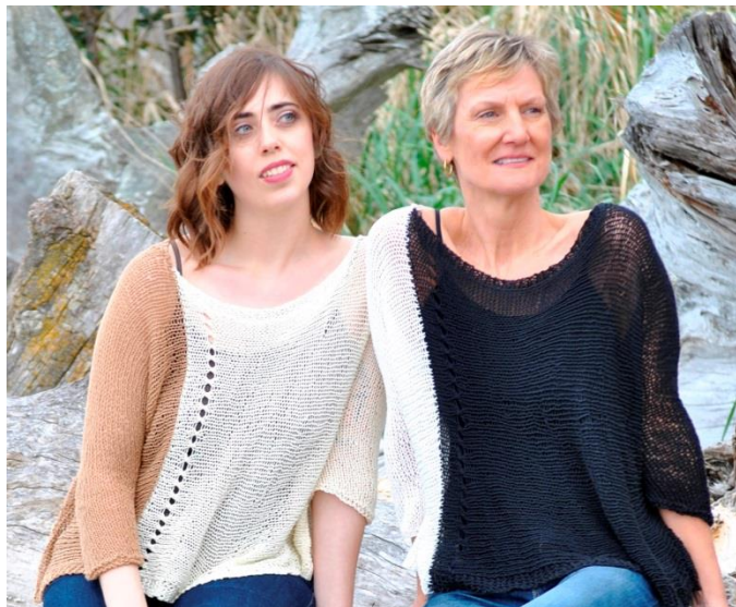
Left is shown in colors #020 & #003. Right is shown in colors #001 & #002.

Designed by Alexander Nicholas for skacel collection, Inc.