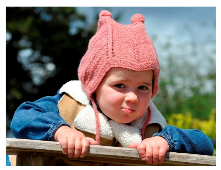
SKILL LEVEL: Intermediate SIZE & MATERIALS:

Pattern created by Karin Skacel. Pattern based on an infant's bonnet bought on the streets of Peru.